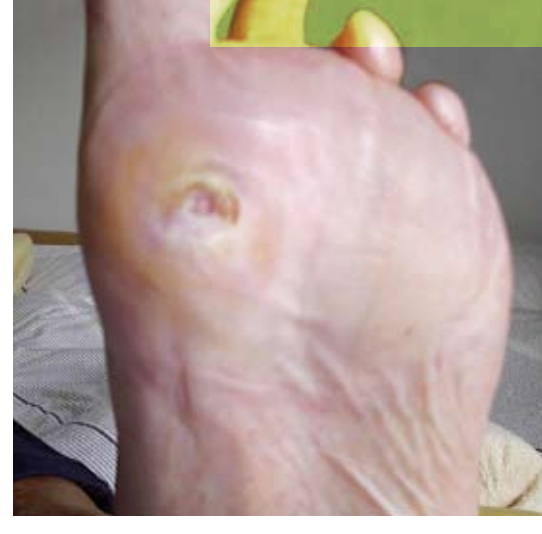
Figure 1: Diabetic foot ulcer